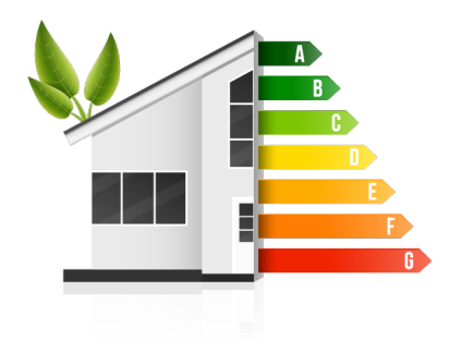
Energy certificate: Pending

Whether you're looking for a permanent residence, a holiday retreat, or a savvy investment, this contemporary villa in San Pedro del Pinatar ticks all the boxes.