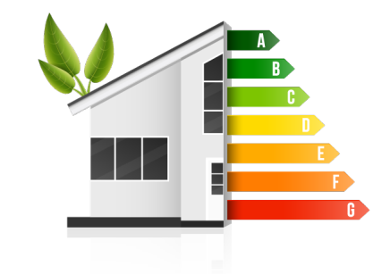
Energy certificate: Pending

Semi-detached house located in La Regia, Cabo Roig, with private pool and garage, 500 m from the Campoamor beaches.~Built on a 510m2 plot, and with an area of about 240m2, this classic-design home has five spacious bedrooms, two full bathrooms and a toilet, living-dining room with fireplace, glazed front terrace, behind another terrace with barbecue, garage for two spaces.~A large private pool, areas to relax, to enjoy the sun and fresh air. The corner location, with three orientations (east, south and west), allows for excellent natural lighting throughout the day, creating a cozy atmosphere.~Perfect to live all year round or enjoy a magnificent vacation.~